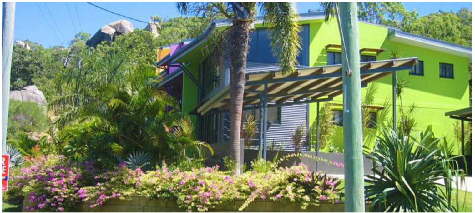
20 Yule Street, Picnic Bay