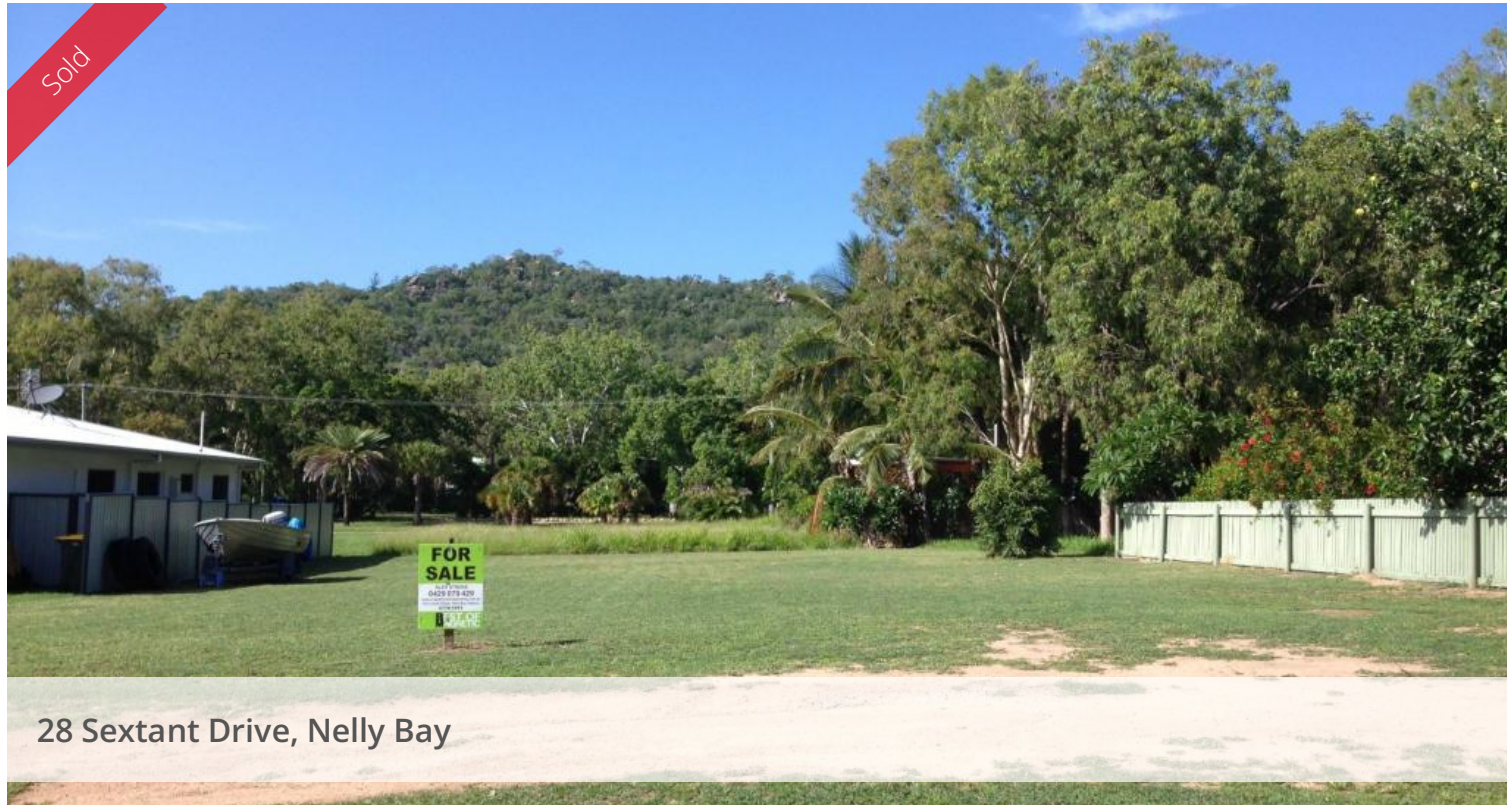
28 Sextant Drive, Nelly Bay