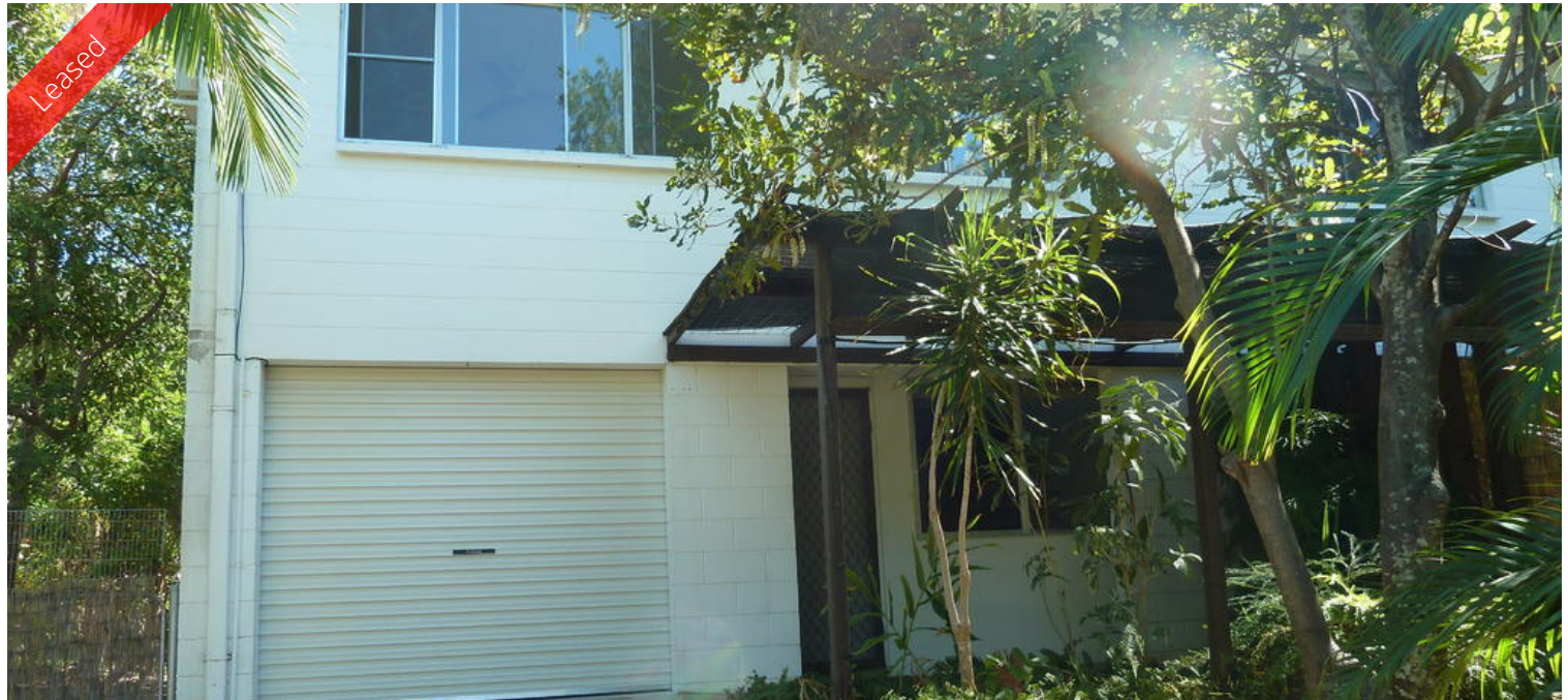
Unit 2, 10 Mirimar Crescent, Arcadia