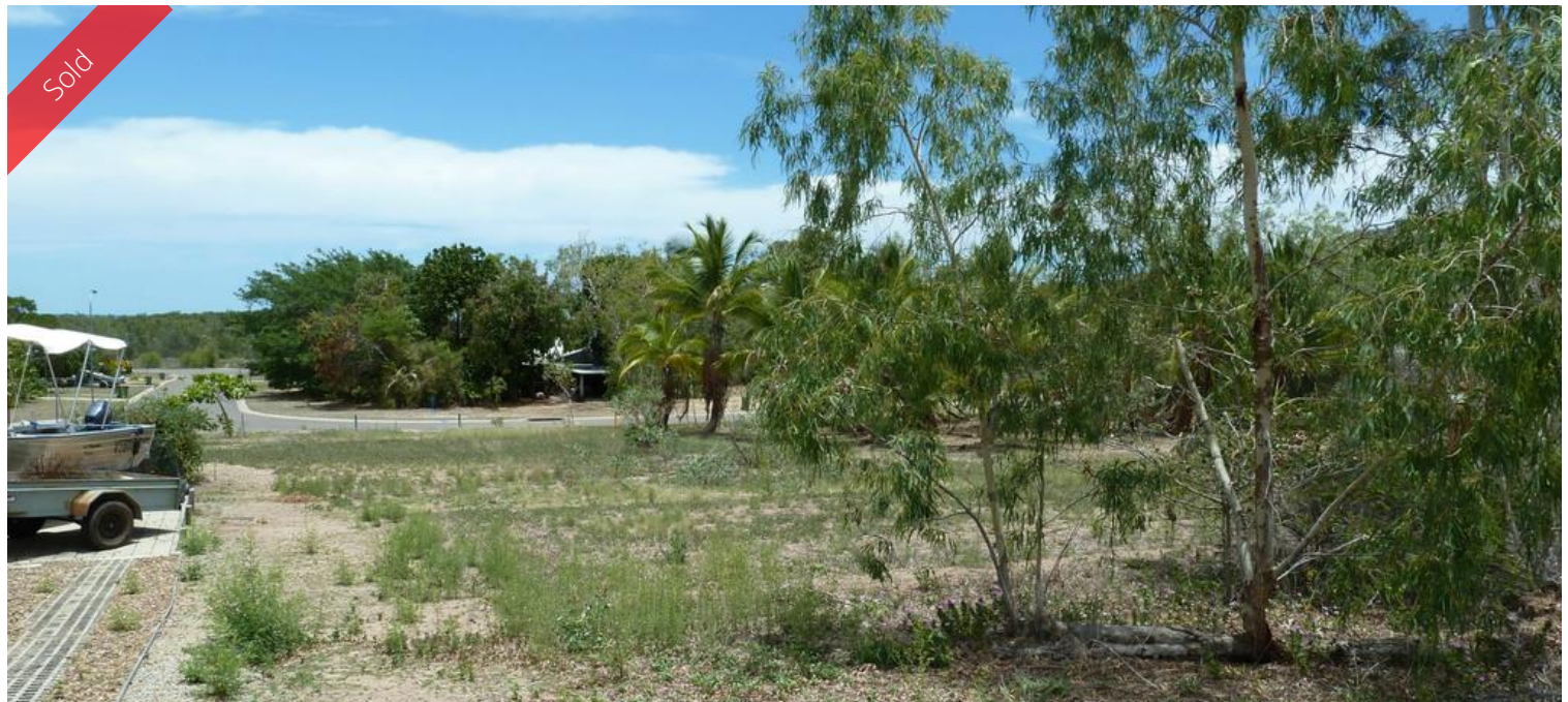
17 Wallaby Way, Horseshoe Bay